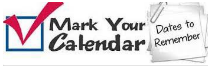
at Valentine's Day!